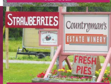
Seasonal Fruit & Produce, Cheese Curds & Home Baking