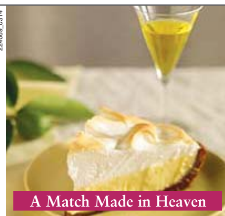
A Match Made in Heaven