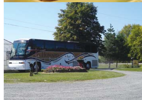
Tours Available All Year